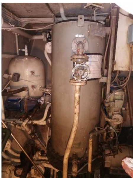
BILGE WATER SEPARATOR